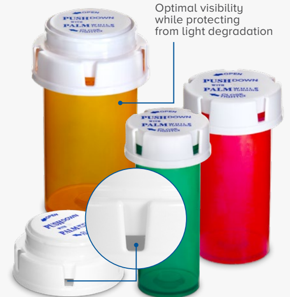
Improved closure enhances comfort

Choice™ closures are reversible to be used as a child-resistant or a snap-on lid